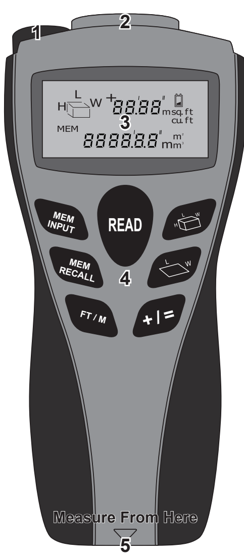
Figure A: Components